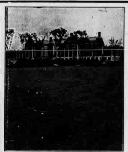
The Nassau Country Club e of the many golf courses wh Grass Seed is supplied by the Stumpp & Walter Co.

For the GOLF COURSE, TENNIS COURT or LAWN