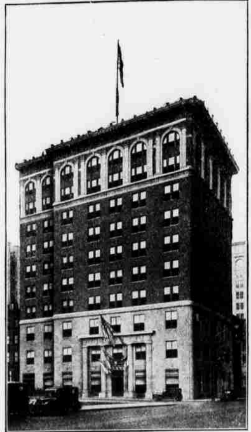
BROOKS BROTHERS' BUILDING

Convenient to Grand Central, Subway, and to many of the leading Hotels and Clubs