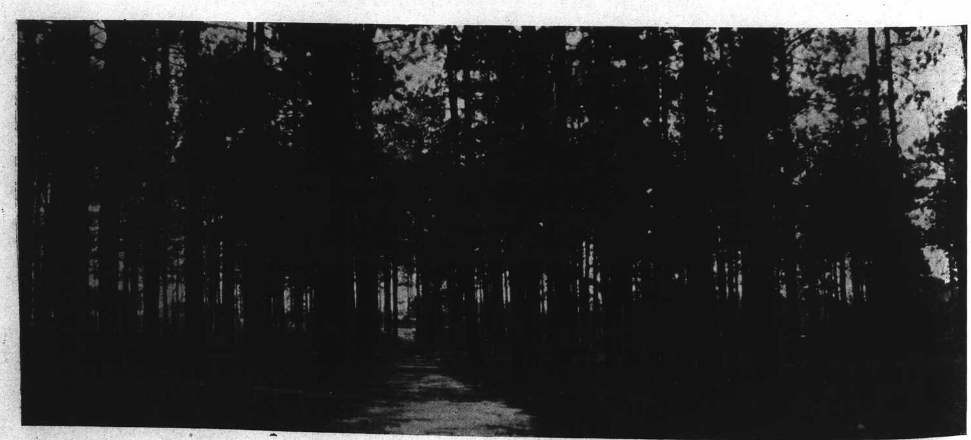
A Canter or Hike Through Long-Leaf Pines Cannot Help but Heighten One's Sense of the Beauties of Nature in the Sandhills