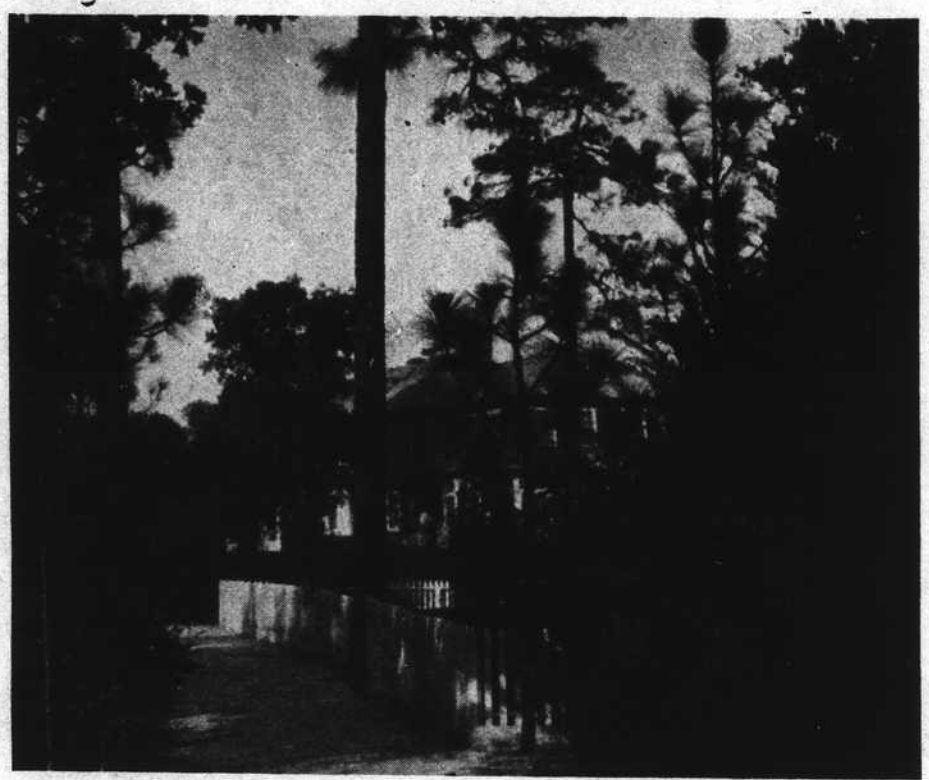
A Typical Pinehurst Cottage Surrounded by Friendly Pines .