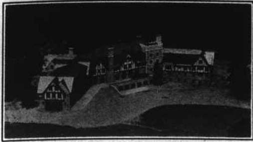
Air Glimpse of Sedgefield Inn