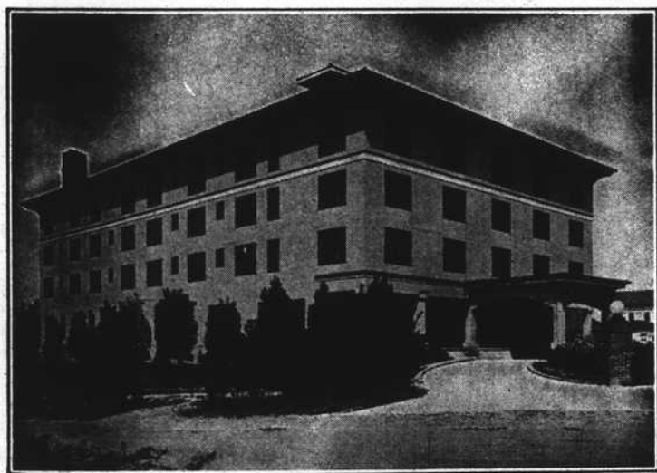
ERECTED IN 1923