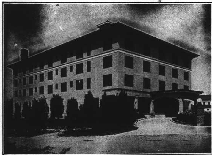
ERECTED IN 1923