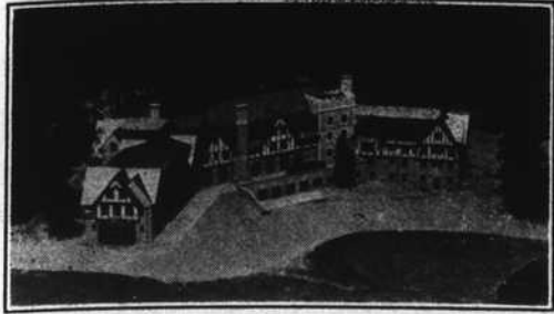
Air Glimpse of Sedgefield Inn