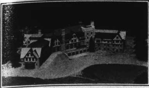
Air Glimpse of Sedgefield Inn