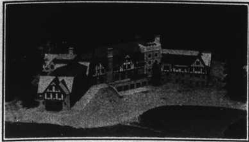
Air Glimpse of Sedgefield Inn