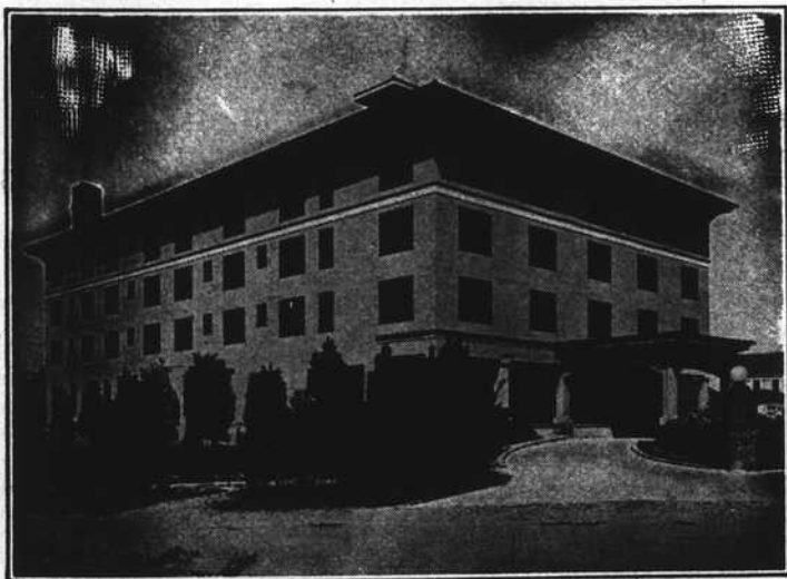
ERECTED IN 1923