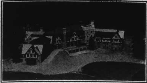
Air Glimpse of Sedgefield Inn