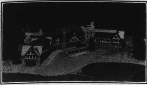
Air Glimpse of Sedgefield Inn