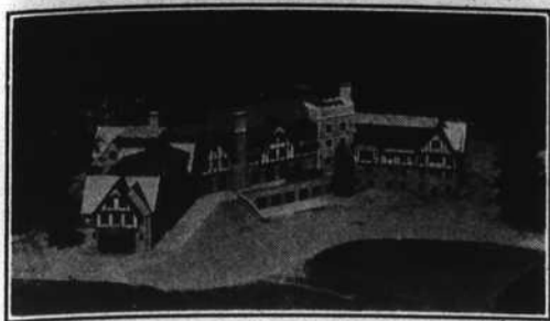
Air Glimpse of Sedgefield Inn