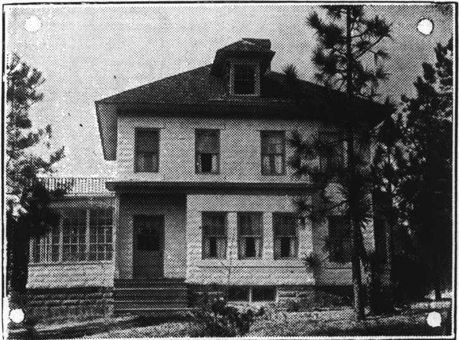
Rental No. 5—$750. Price $10000.

Building plots at low prices for discriminating people who love nature and a bird sanctuary.