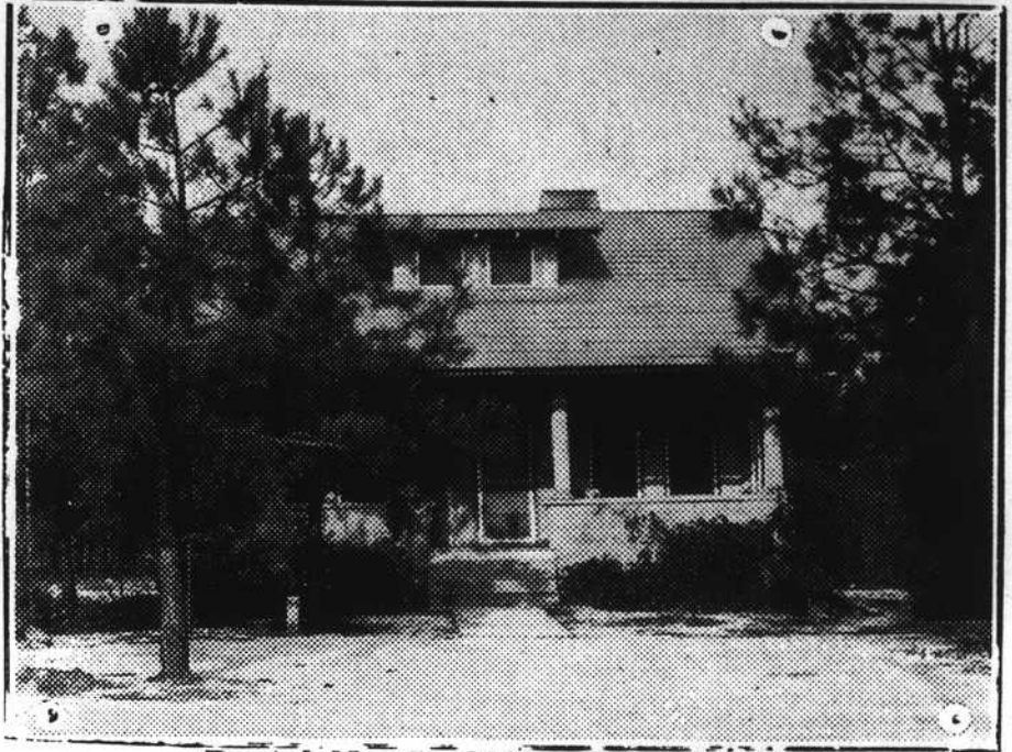
Rental No. 2—$600. Price $6500.

Rental No. 2 and No. 4 $600. Price $6500. Rental No. 5, $750. Price $10000. Easy terms. Newly furnished and fine order.