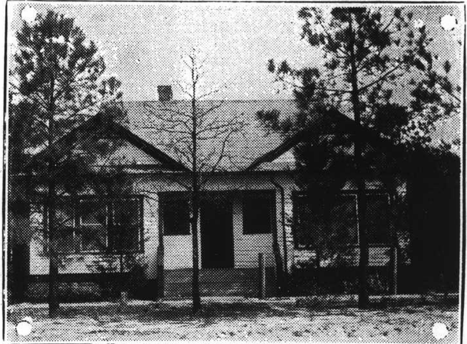
Rental No. 4—$600. Price $6500.