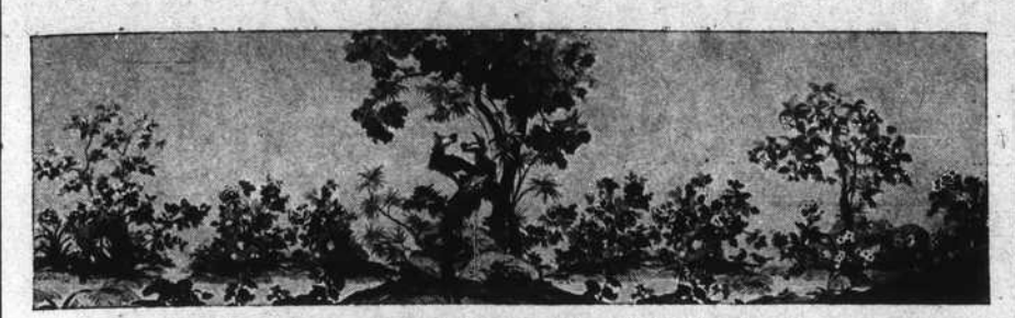
THE PHOENIX BIRD SCENIC—A beautiful pictorial wall-paper, band-printed, requiring over 800 blocks in the printing.

THE ever-growing popularity of Lloyd's wallpaper and grasscloth is due to their beauty and durability. We have a wide selection of exclu-