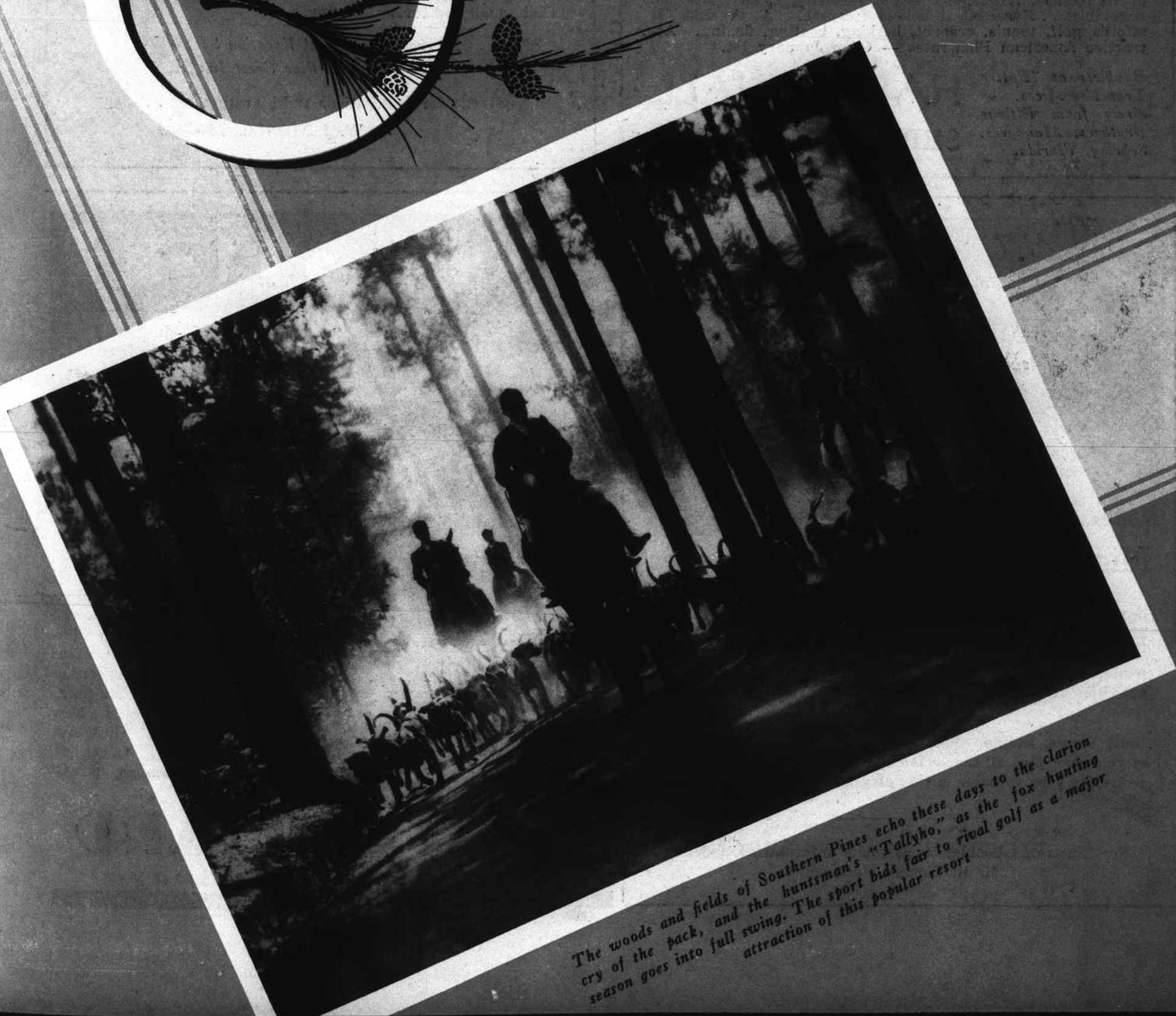
The woods and fields of Southern Pines echo these days to the clarion cry of the pack, and the huntsman's "Tallyho," as the fox hunting season goes into full swing. The sport bids fair to rival golf as a major attraction of this popular resort