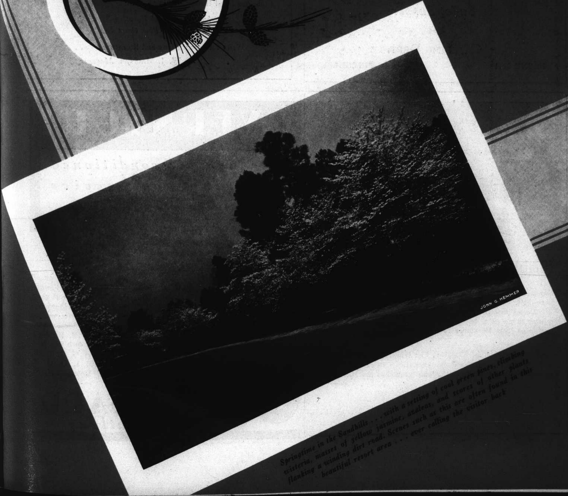
JOHN G. HEMMER

Springtime in the Sandhills . . . with a setting of cool green pines, climbing wisteria, masses of yellow jasmine, azaleas, and scores of other plants flanking a winding dirt road. Scenes such as this are often found in this beautiful resort area . . . ever calling the visitor back