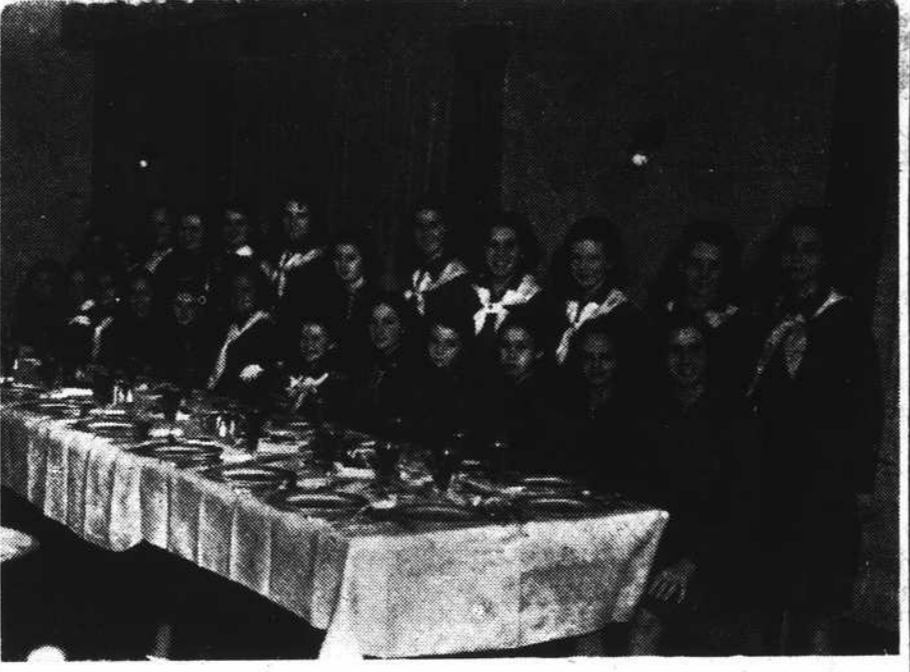
(Outlook Engraving) A GROUP OF PINEHURST GIRL SCOUTS