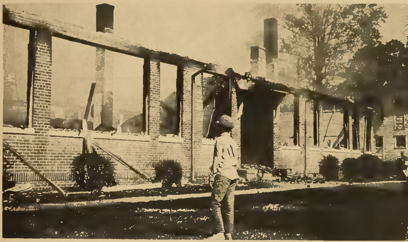
NOT MUCH LEFT — The charred skeleton was about all left standing as firemen continued to fight the blaze of unknown origin which broke out early Saturday in the abandoned Mars Hill School at Trap, described as "one of the better buildings in

the Bertie County School system." Complaint to the Civil Rights Division of the Justice Department the same day, brought FBI investigators into the picture.