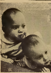
"THE BOSS" NEW SECRETARY?"

A NEW MERCANTILE POLICY packages virtually all property and casualty insurance required for a business at 10% to 20% saving over the separate policies. Let us at The Joe Bryant Insurance Agency analyze this new Mercantile Policy with you.