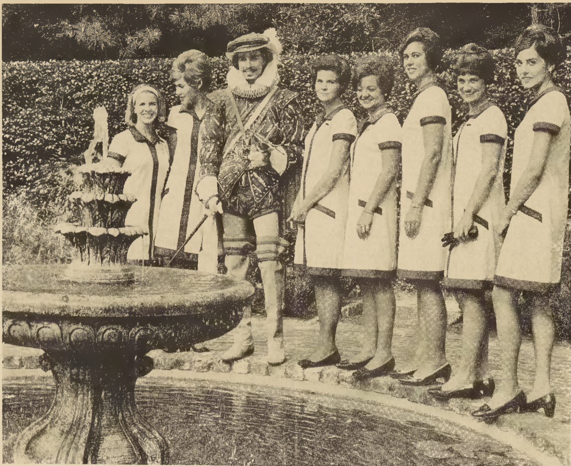
"HERE'S WHERE IT ALL STARTED" - Seven of the hostesses who will staff the two new State Travelers' Welcome Centers will open August 1 south of the Virginia line on Interstate Highways 85 and 95 visited Roanoke

That each party to this proceeding shall pay their own costs. The Court retains jurisdiction