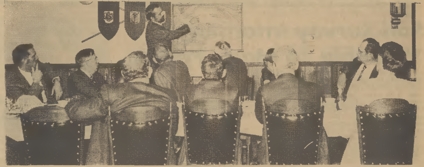
COUNTY COMMISSIONERS FROM Northampton and Halifax Counties were briefed this week by representatives from the Albemarle Paper Company on the company's new $3.3 million project increasing its waste water treatment facilities. The main plant is located on the Halifax side of the Roanoke River but its