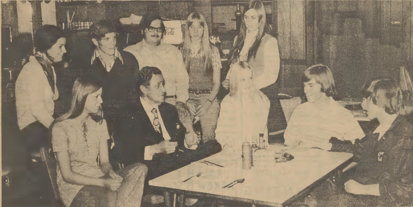
FOLLOWING A MEETING WITH a local civic club Congressman L. H. Fountain gave a short talk to area students and answered their questions in a Rich Square restaurant. The group was composed of one Chowan College student and the rest were from Northeast Academy in