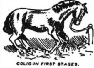
COLIC IN FIRST STAGES.

No disease to which horses and mules are subject is more dangerous than colic, and none more easily cured when the correct remedy is used. Colic attacks so suddenly and oftentimes so severely that it is of the utmost importance to relieve the animal at once in order to save its life. ASHCRAFT'S COLIC MIXTURE gives relief speedily and surely, leaving no bad after-effects. It has stood the test for 25 years.