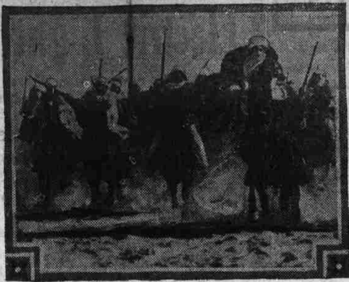
PRISCILLA DEAN AS LEADER OF THE BLACK HORSE TROOP IN THE UNIVERSAL JEWEL MASTER PRODUCTION "THE VIRGIN OF STAMBOUL"