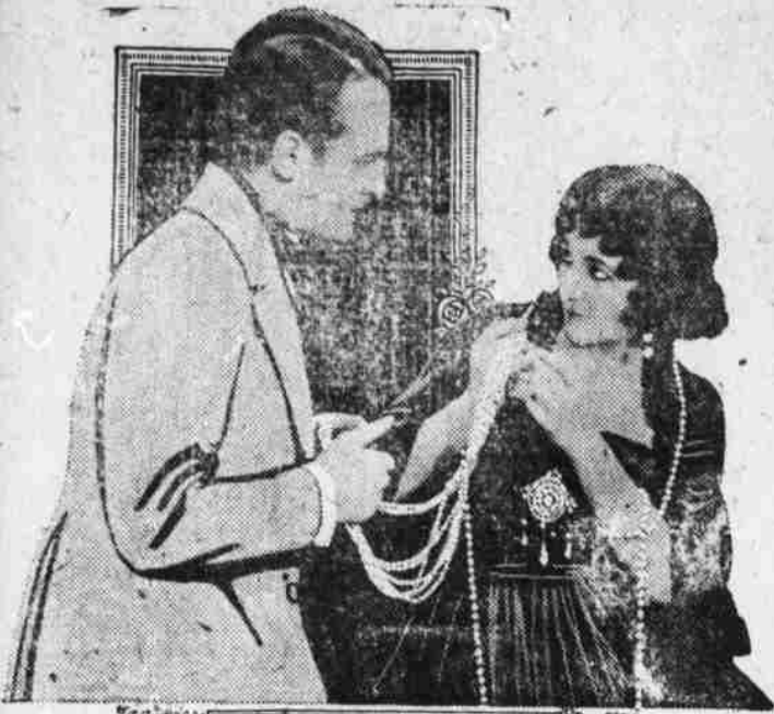
DORIS KEANE in "ROMANCE"

And so she laid bare her very soul to him—told him the whole pitiful story—and knew at that burning word was carrying him further from her