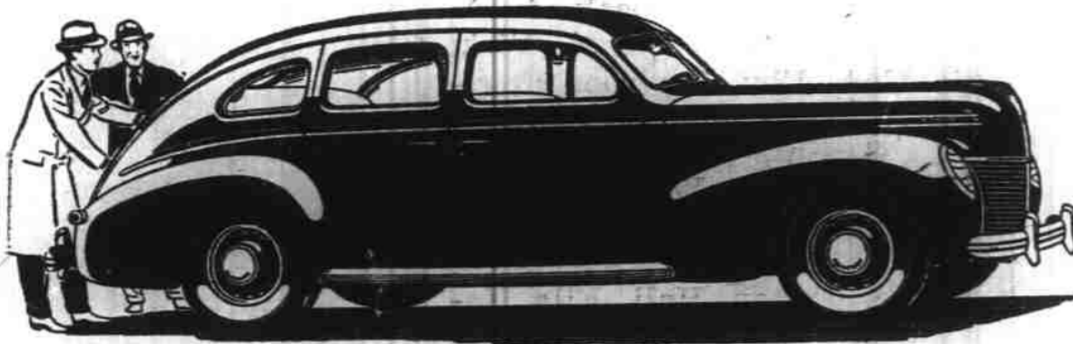
The Mercury V-8 Town-Sedan $934★

MERCURY 8: An entirely new car. Fits into the Ford line between the De Luxe Ford and the Lincoln-Zephyr. Distinctive styling. 116-inch wheelbase. Unusually wide bodies. Remarkably quiet. Hydraulic brakes. New 95-hp. V-8 engine.