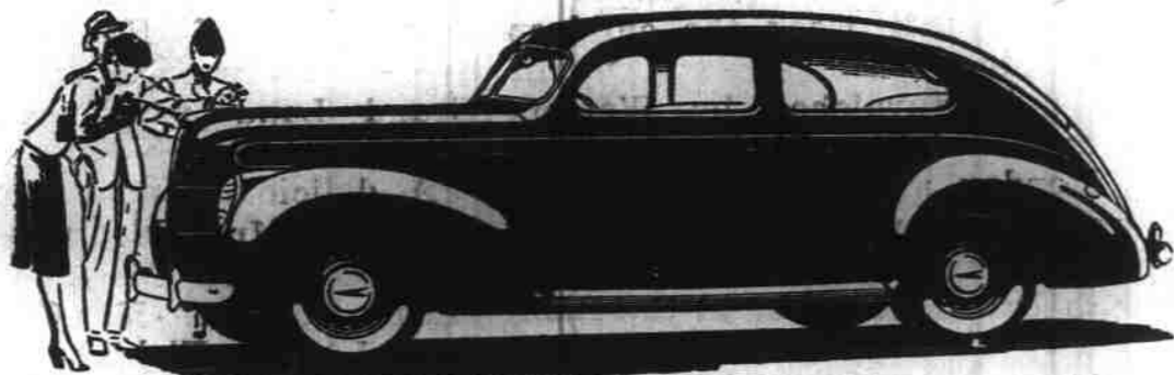
Ford V-8 Tudor Sedan: with 40-hp. engine, $624★—with 85-hp. engine, $664★

DE LUXE FORD V-8: Provides all the basic Ford features, with extra luxury. Remarkable amount of equipment included in price. Hydraulic brakes. 85-hp. V-8 engine. Sets a new high for low-priced cars—in appearance and performance.