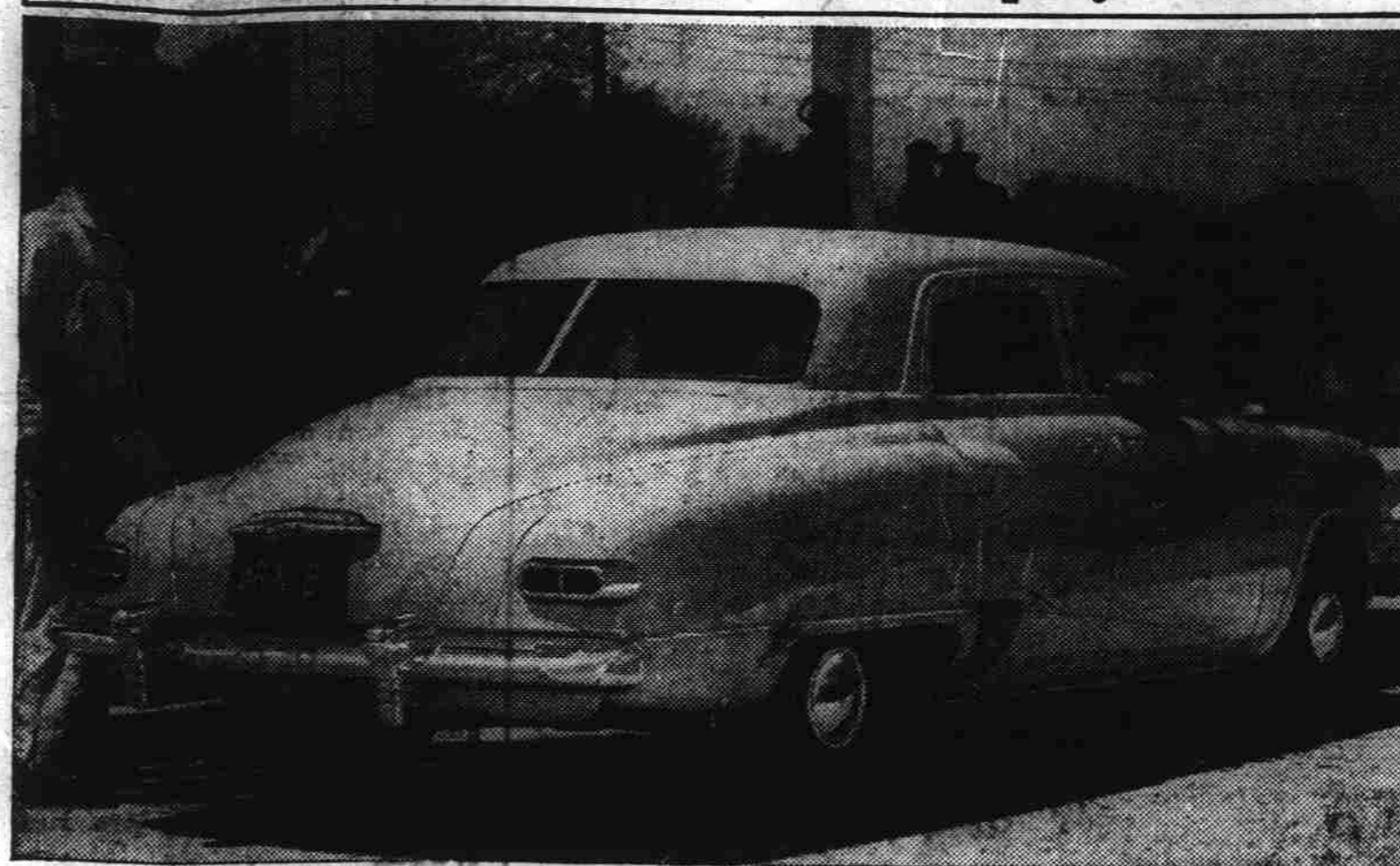
The much-discussed 1947 Studebaker, described as "the first genuine postwar automobile," has been placed on display at dealer showrooms here. Lower and wider bodies, re-engineered weight distribution that adds immeasurably to riding safety and comfort, mechanical advances that include self-adjusting brakes and stronger, box-section frames are among the many highspots. Pictured above is the four-door Champion sedan.