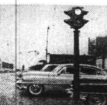
Total working horsepower wherever "cold engine stalling" is a critical problem on cool, moist days. Its special additive protects against stalling caused by carburetor icing, parmits maximum possible power-flow from the time you start your engine.