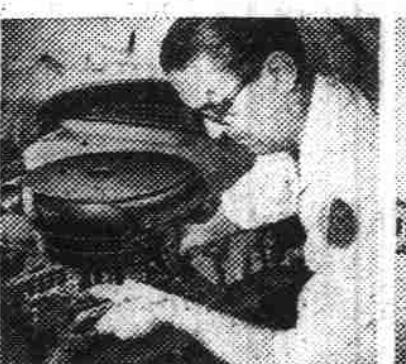
for many new cars where total performance is now kept "under wraps" by retarding the spark to avoid knocking. These cars may be set to fully efficient timing, getting more horsepower, better gas mileage.