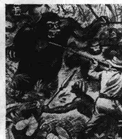
BATTLE OF THE GORILLAS! First time in film, man battles gorillas in their native lairs!