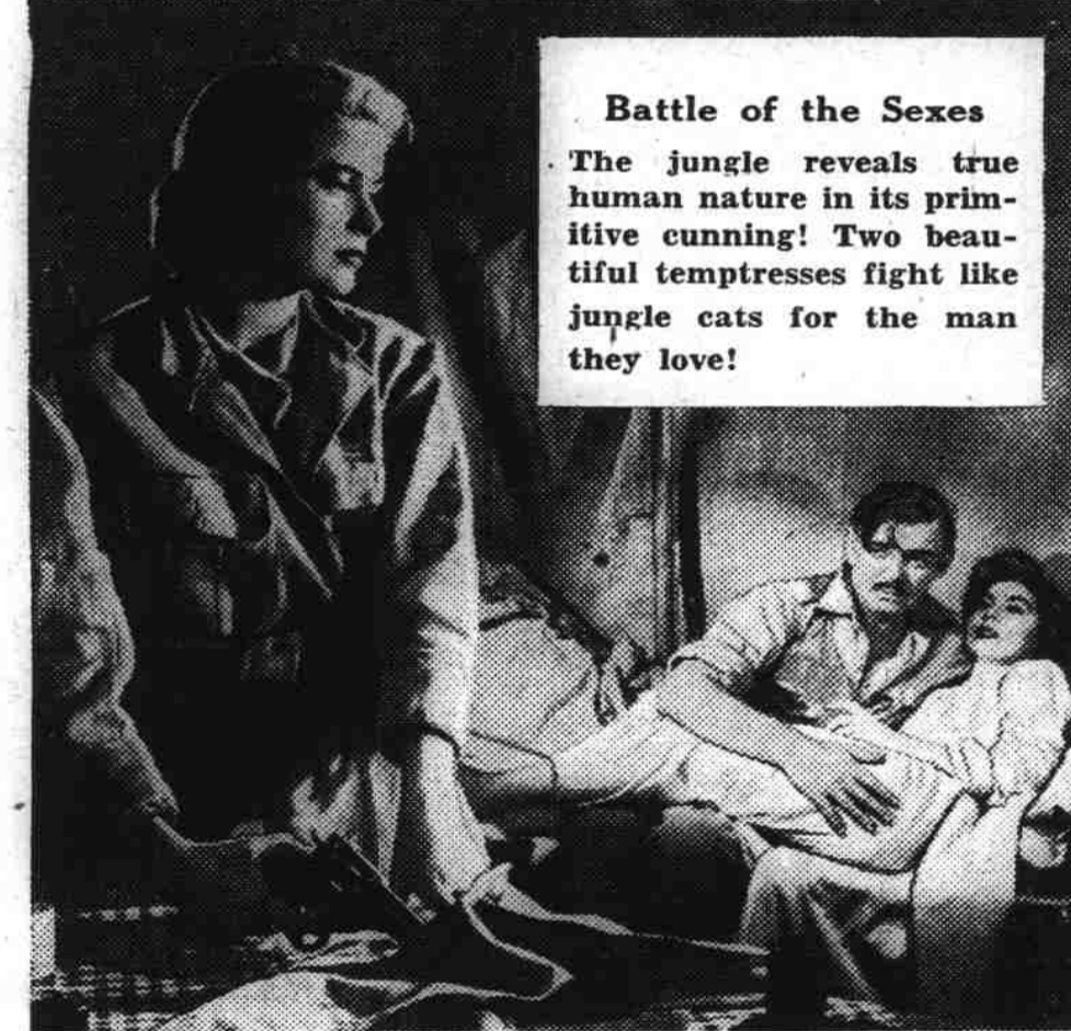
Battle of the Sexes The jungle reveals true human nature in its primitive cunning! Two beautiful temptresses fight like jungle cats for the man they love!

AMID THE TERROR-TEEMING TROPIC WILDERNESS — YOU'LL THRILL TO JUNGLE LOVE AND JUNGLE ADVENTURE SUCH AS THE SCREEN HAS NEVER CAPTURED BEFORE!