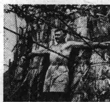
THRILL AFTER THRILL! Test of Courage as the Jungle Boss faces spears of natives!