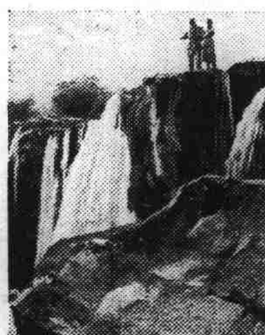
NATURAL WONDERS of breath-taking grandeur match the jungle thrills!