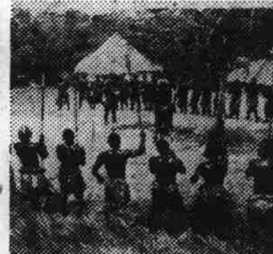
SAVAGE TRIBAL RITES in their authentic savagery filmed in the Dark Continent!