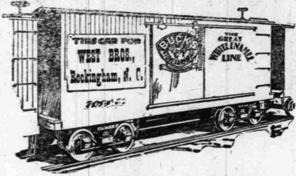
This car of BUCK'S STOVES just arrived for West Bros.

into a sealed box, which will be opened on the night of December put into a large tub and stirred well. Then a blindfolded boy is to party holding the number corresponding to the number on the first ticket has three days in which to show the number and call for the Range. If this number does not show up in three days the party holding number corresponding to second number drawn out has three days, then the third number has three days, etc. So your chances are as good as the other man's.