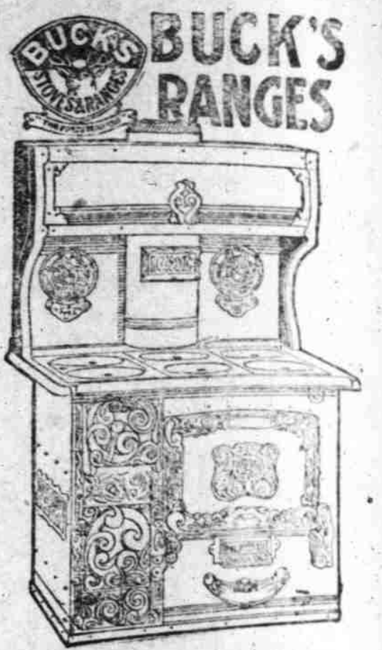
This $75.00 Buck Steel Range to be given away ABSOLUTELY FREE.

chance to draw this beautiful Range. This proposition also. These coupons are put 24th, 1902, and all will be draw out one ticket. The