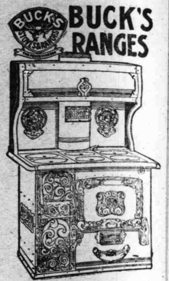
This $75.00 Buck Steel Range to be given away ABSOLUTELY FREE.

into a sealed box, which will be opened on the night of December put into a large tub and stirred well. Then a blindfolded boy is to parry holding the number corresponding the number on the first ticket has three days in which to show the number and call for the Range. If this number does not show up in three days the party holding number corresponding to second number drawn out has three days, then the third number has three days, etc. So your chances are as good as the other man's.