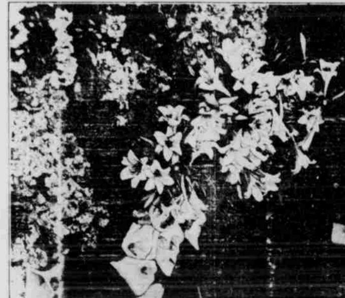
Field Daisies Can Be Grown in the Garden and by Cultivation Become Much More Beautiful Than in Their Native State.