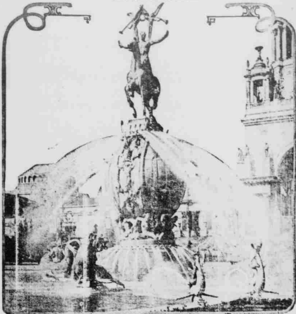
The labor that went into the building of the Panama canal is symbolized in the Fountain of Energy, by A. Stirling Calder. This heroic sculpture stands in the center lagoon of the three lagoons of the South Gardens and faces the main entrance gates. The waters were first released on opening day, February 20, coincidentally with the opening of the portals of the exhibit palace and by the same means, the electric spark transmitted across the continent when President Woodrow Wilson opened the great exposition at San Francisco by wireless.