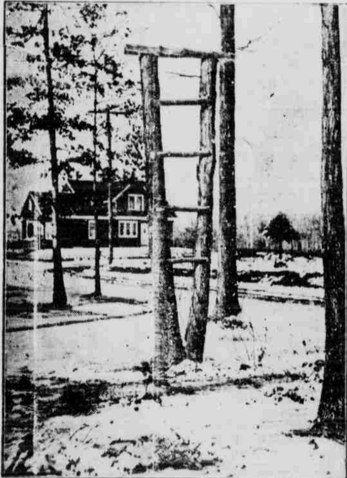
Before the work of spring commences, look over the grounds and make some beauty spots—Dead trees can be cut partially down and made to form artistic and substantial trellises for either rose bushes or vines.