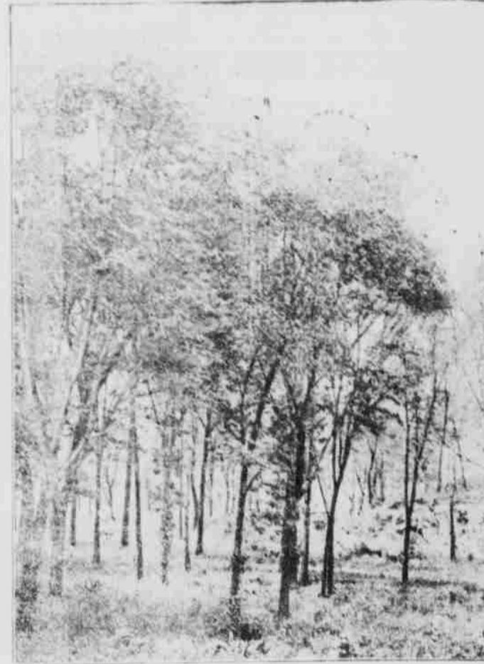
Go to Your Own Woods and Select Your Trees.