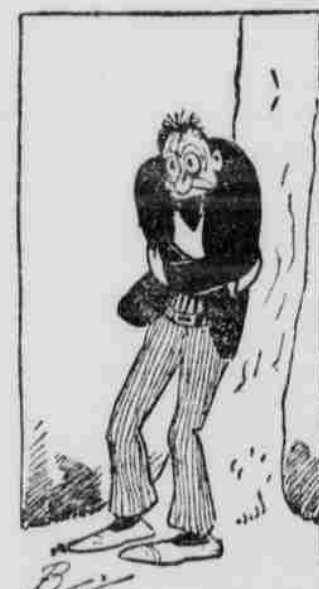
"Geta Magensauze From Eating Frankfurters."

public accountant, Birskey, I figure that if 99 per cent of Christmas shoppers followed Miss Morgan's advice, Birskey, the dry-goods stores would shut down around Christmas, and all them salesladies would not only take a vacation in the summer time, but in the winter time also; and then the question is, how is them salesladies going to raise money for their winter vacations?" "Miss Morgan would get up a subscription maybe," Birskey suggested. "And the proceeds after the expenses of collection were deducted would support twenty-three six hundredths of a saleslady for 6,008 hours, Birskey." Zapp concluded, "which the trouble with them people that figure out the averages is that they don't consider human beings as men and women, but as fractions sugereckoned to hundred thousandths yet. Also it's a good thing to figure out the averages on the percentages of people that set off fireworks and don't get burned, and the percentage of people that it wouldn't do a bit of harm to if they