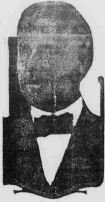
O. MAX GARDNER For Governor

Saturday, June 5, is the day set by the Democrats of North Carolina for the selection of a candidate for governor. Lieutenant Governor O. Max Gardner is a candidate for the nomination. In asking the support of the citizens of the state, Mr. Gardner stands upon the platform of fitness and his friends commend him as being, by training and experience, equipped for the position.