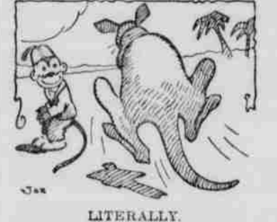
LITERALLY. Monk: Look at old kangaroo, he's just hopping mad.