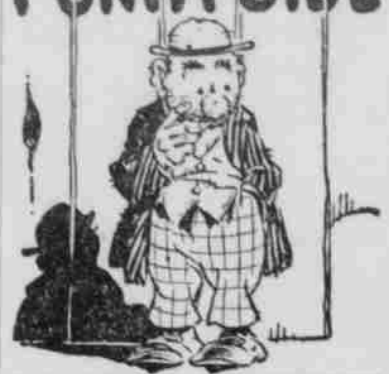
THE MORE THE MERRIER.

"Maybe," mused Senator Sorghum, "it would be a good thing to have hundreds of thousands more government employees."