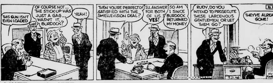
MUTT and JEFF