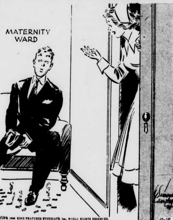
"I'll give you a hint. Your wife says for you to think up THREE names instead of one."