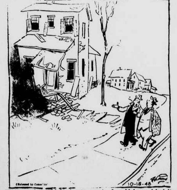
"This one just sold for ten thousand. I could have picked it up last year for nine thousand."