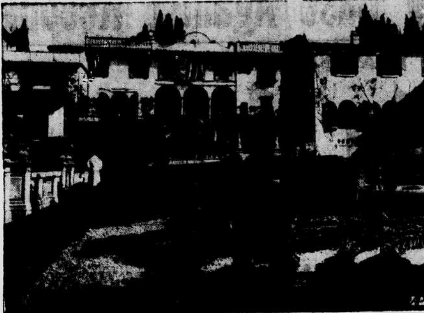
GIFT FOR MUSIC —This villa in Florence, Italy, was the home of Myron Taylor, U.S. presidential envoy to the Holy See, before he gave it to Pope Pius XII as music school for U.S. students. It will be known as the Pope Pius XII Musical Institute.