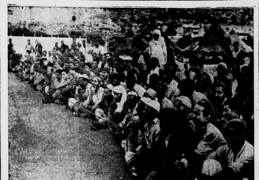
ARAB PRISONERS IN ISRAEL — Arab prisoners watch entertainment by others of their group in an Israel camp. Man second from right wears U.S. army sergeant's shirt.