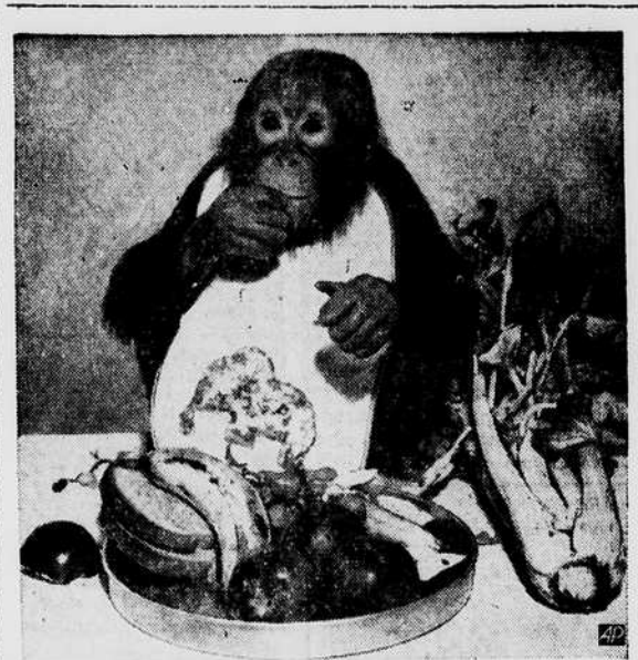
IT'S DINNER TIME - Tia, young orangutan from Borneo, is ready for a holiday feast at Chicago 200.