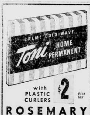
ROSEMARY Drug Company

employees at Hatcher's Res trant, with chicken dinner for followed by an informal en-