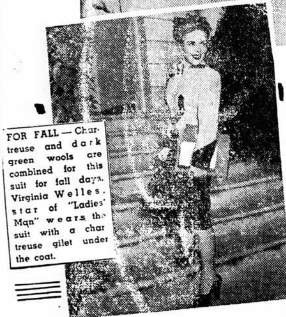
FOR FALL —Chartruse and dark green wools are combined for this suit for fall days. Virginia Welles, star of "Ladies' Man" wears the suit with a chartruse gilet under the coat.