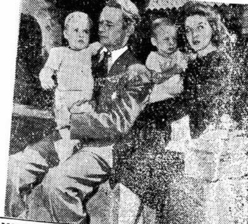
MOVIE PAIR HOMELESS AGAIN —Actor Tom Barker, his actress wife, Susan Hayward and their two children evicted from Hollywood homes for the third time this year. They refuse to pay exorbitant rent or a bonus for an apartment.