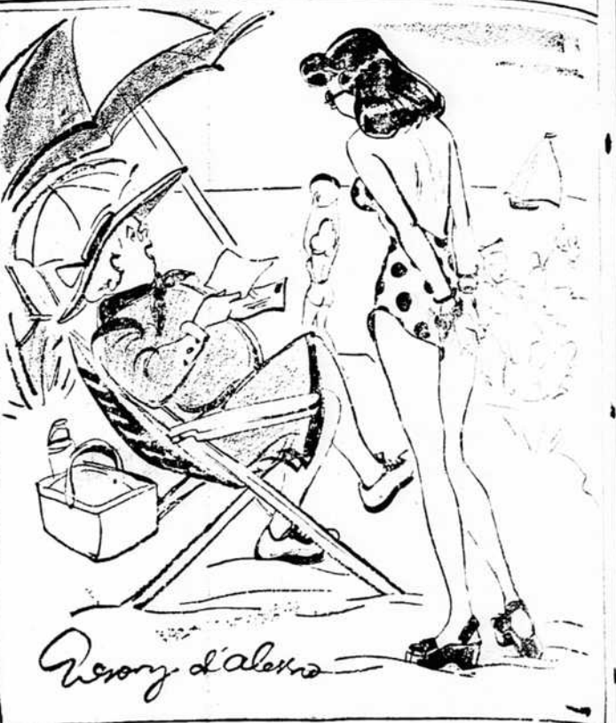
"I gather from your father's letters that he's not enjoying our vacation!"