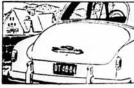
EXTRA BEAUTY AND QUALITY of Body by Fisher