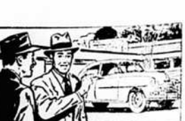
EXTRA PRESTIGE of America's Most Popular Car