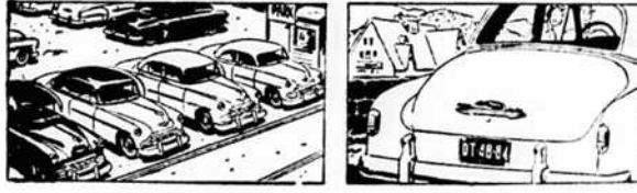
EXTRA WIDE CHOICE of Styling and Colors

MORE PEOPLE BUY CHEVROLETS THAN ANY OTHER CAR!