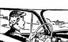
EXTRA STEERING EASE of Center-Point Steering