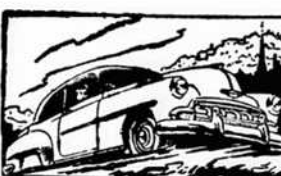
EXTRA SMOOTH PERFORMANCE of Centerpoise Power