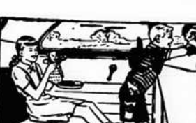
EXTRA STRENGTH AND COMFORT of Fisher Unisteel Construction