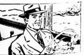
EXTRA SMOOTHNESS of POWER Automatic Transmission

A complete power train with extra-powerful Valve-in-Head engine and Automatic Choke. Optional on De Luxe models at extra cost.