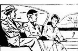
EXTRA RIDING COMFORT of Improved Knee-Action