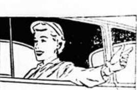
EXTRA STOPPING POWER of Jumbo-Drum Brakes