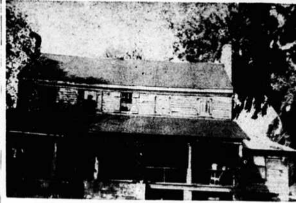
ORIGINAL BUCK HOME