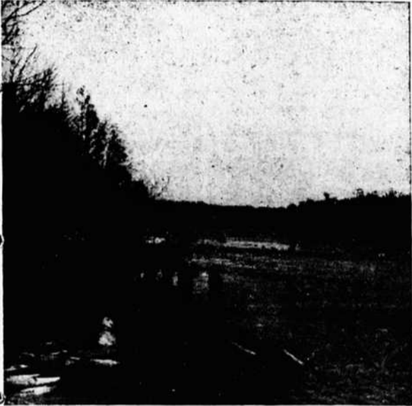
ONLY STUMPS REMAIN