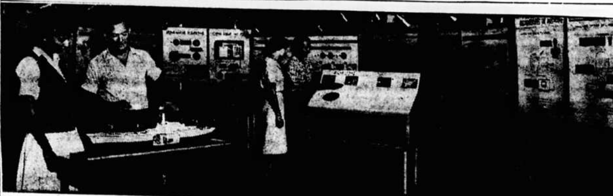
YAM FESTIVAL EXHIBIT—This is a portion of the "Atoms for Peace" exhibit that will be displayed at the Yam Festival beginning October 22 and continuing through October 24. The exhibit displays many ways atomic energy is being converted into peaceful uses.