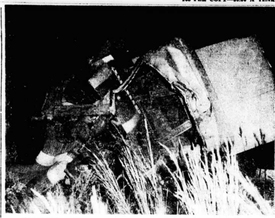
TWO DIE — Two men died Sunday after the car in which they were riding crashed into a pecan tree beside the old Conway-Whiteville highway during a race. A portion of the car is shown in the picture.