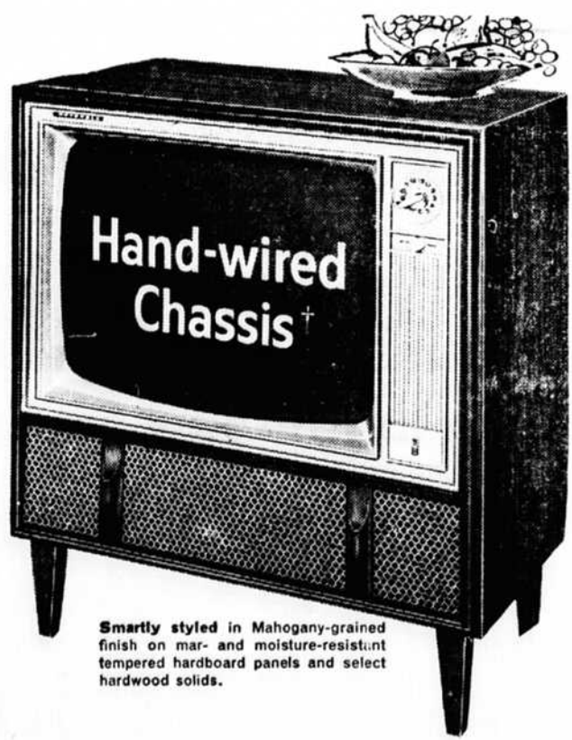
Smartly styled in Mahogany-grained finish on mar- and moisture-resistant tempered hardboard panels and select hardwood solids.

All Full Line Of 23" Table & Console Models To Match Any Price & Any Budget — Check The Fabulous Features Below —