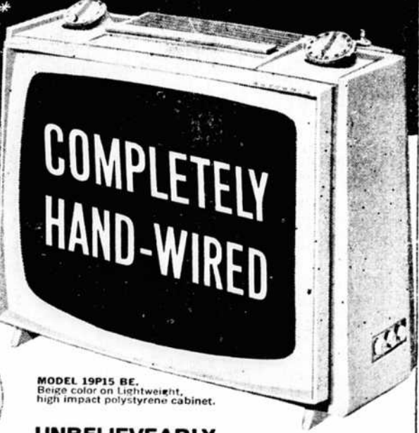
MODEL 19P15 BE. Beige color on lightweight, high impact polystyrene cabinet.