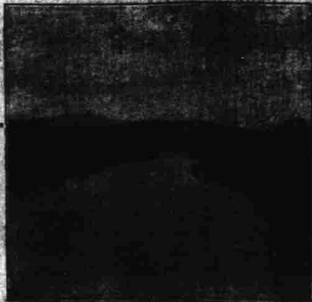
SCENES ON THE TUCKASEE RIVER.