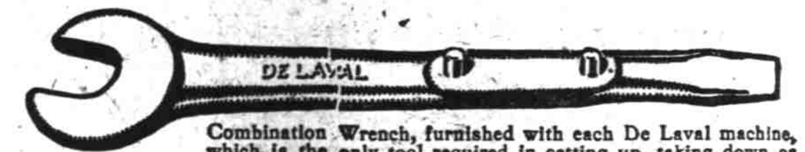
Combination Wrench, furnished with each De Laval machine, which is the only tool required in setting up, taking down or using the De Laval, the simplest cream separator ever built.

NOR ARE THERE ANY PARTS WHICH REQUIRE FREQUENT adjustment in order to maintain good running or to conform to varying conditions in the every-day use of a cream separator.