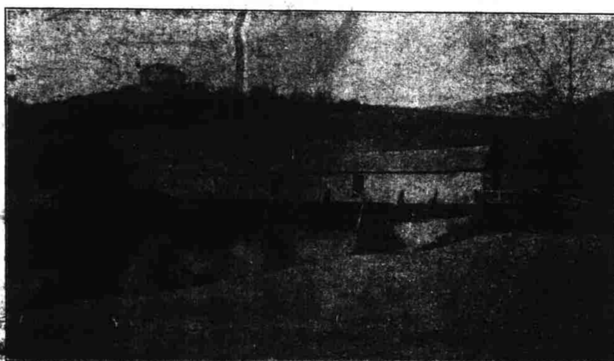
SCENES ON THE TUCKASEEGEE--"THE RIVER OF THE WINDING SNAKE"